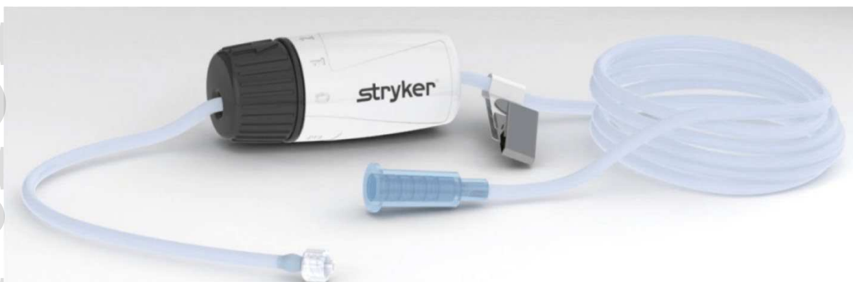
Figure 6: Pureview In-line Filter (Stryker)