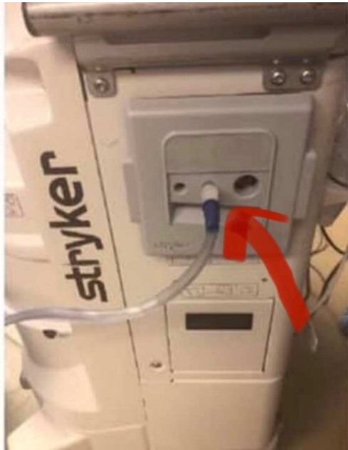
Figure 8: Stryker Neptune ULPA Filter Access