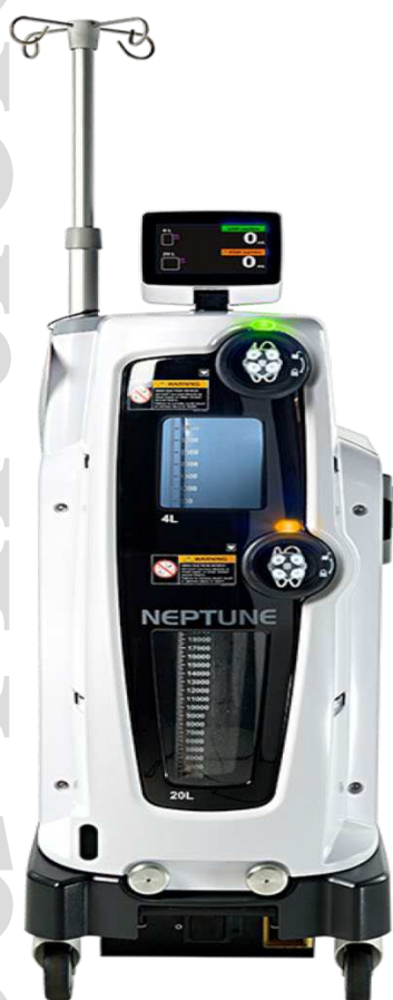
Figure 7: Neptune 3 Waste Management System (Stryker)