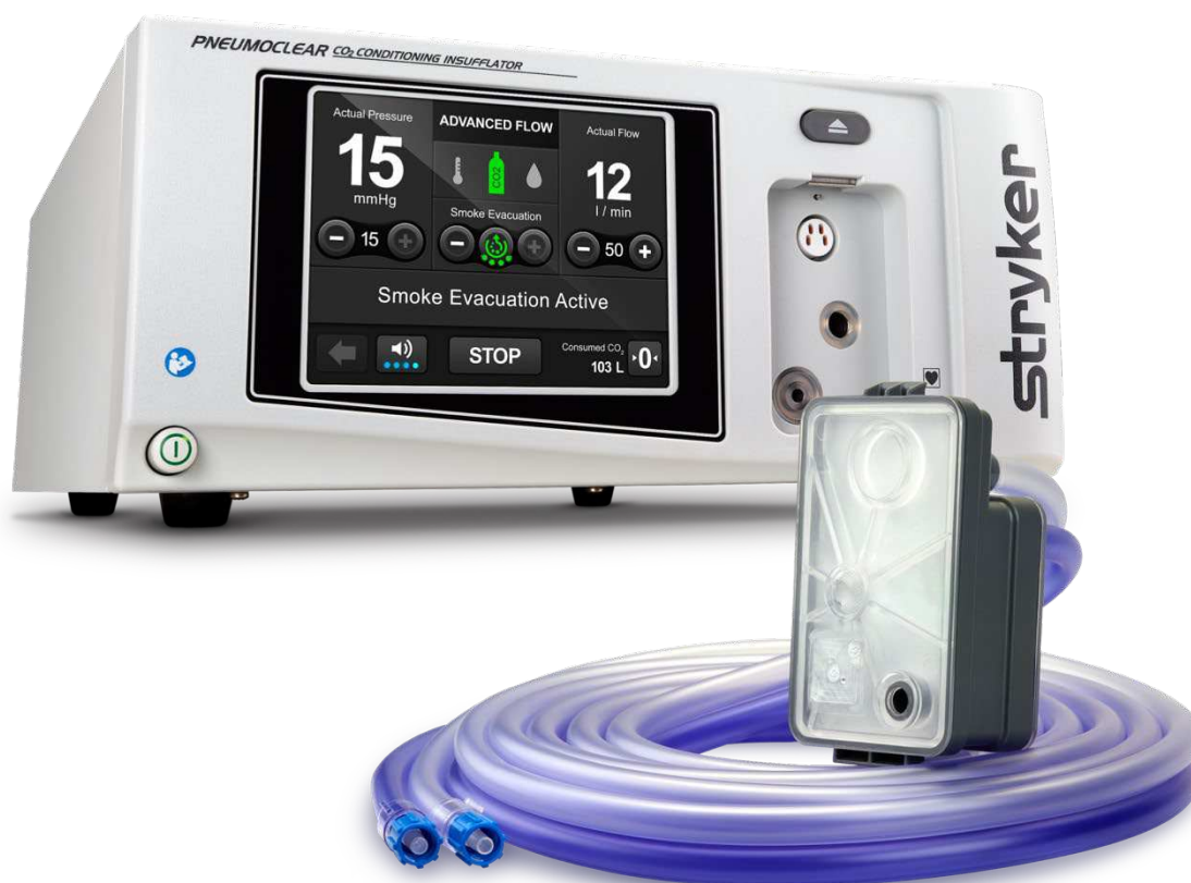
Figure 4: Pneumoclear Smoke Evacuation System (Stryker)