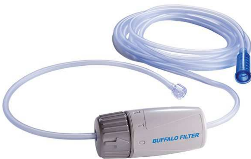
Figure 5: Plume Port Active (Buffalo Filter, Conmed)