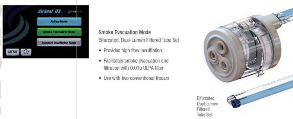
Figure 2: AirSeal Smoke Evacuation Mode (Conmed)